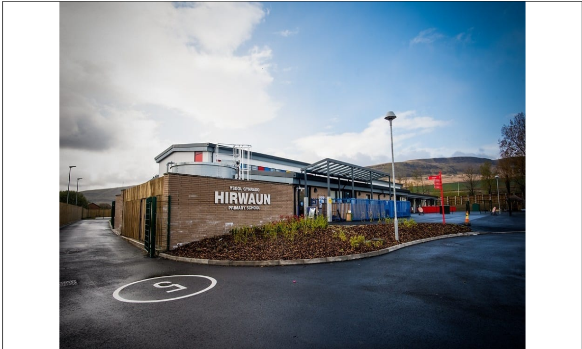
External view of Hirwaun Primary School.

The table that follows outlines the pupil numbers at Hirwaun Primary School over the previous five academic years.