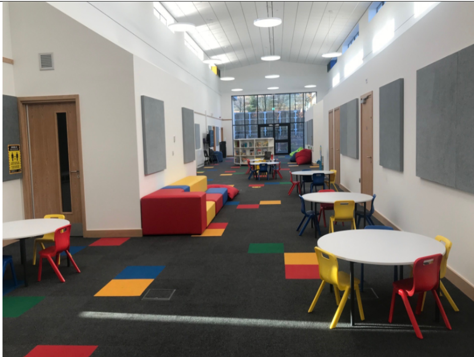
A multi-purpose learning resource area or 'heart space' at Hirwaun Primary School.