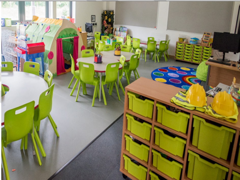
Foundation phase classroom in Hirwaun Primary School.