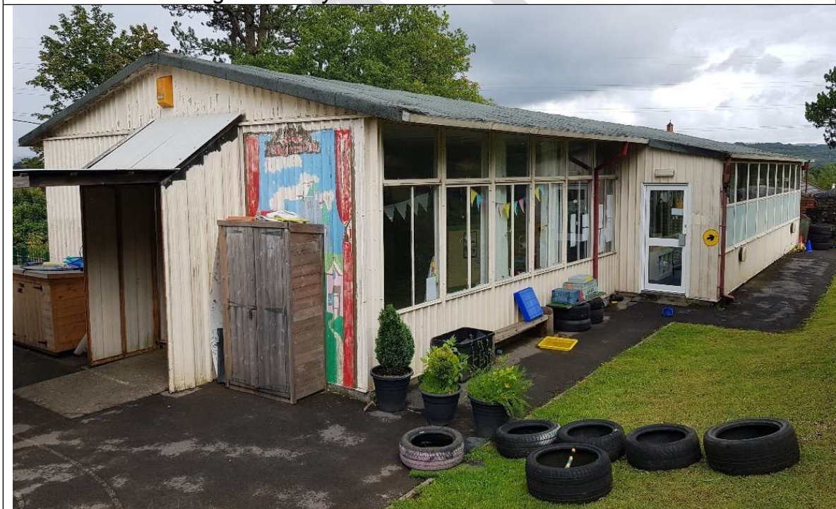
External view of the metal prefabricated building