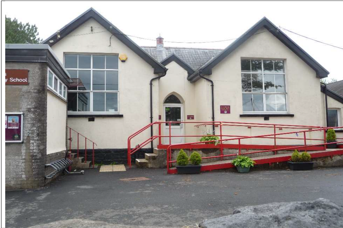
External view of Rhigos Primary School.