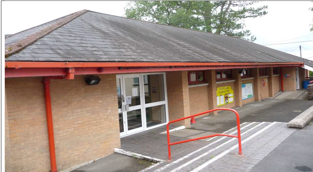
External view of the hall and canteen building

The table that follows outlines the pupil numbers at Rhigos Primary School over the previous five academic years. They were obtained from the statutory Pupil Level Annual School Census (PLASC) which must be undertaken in January each year. The number of nursery age pupils for each academic year is shown separately, as required by the Welsh Government's School Organisation Code 2018 (011/2018).